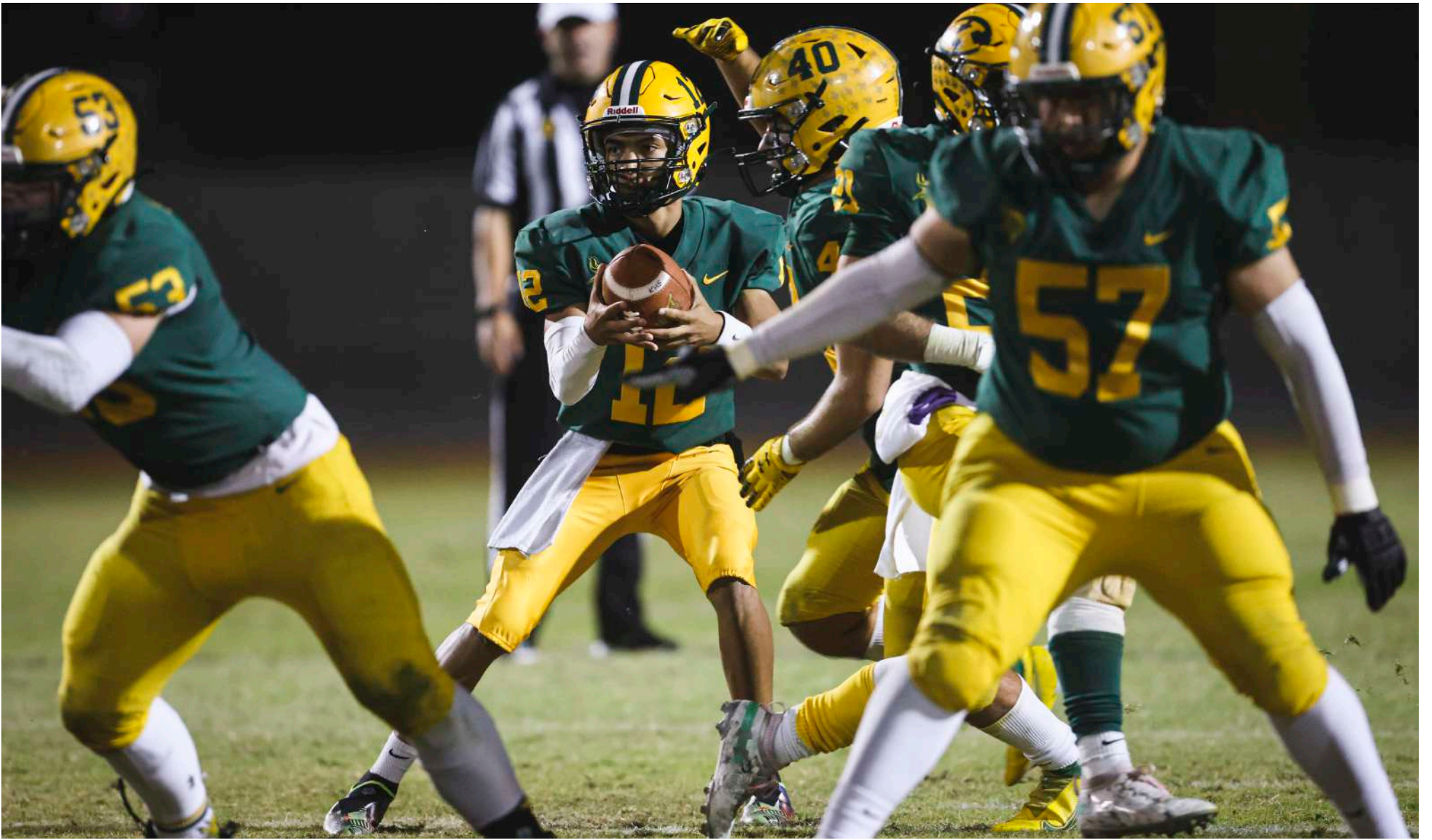
Samuel Marshall Photographer