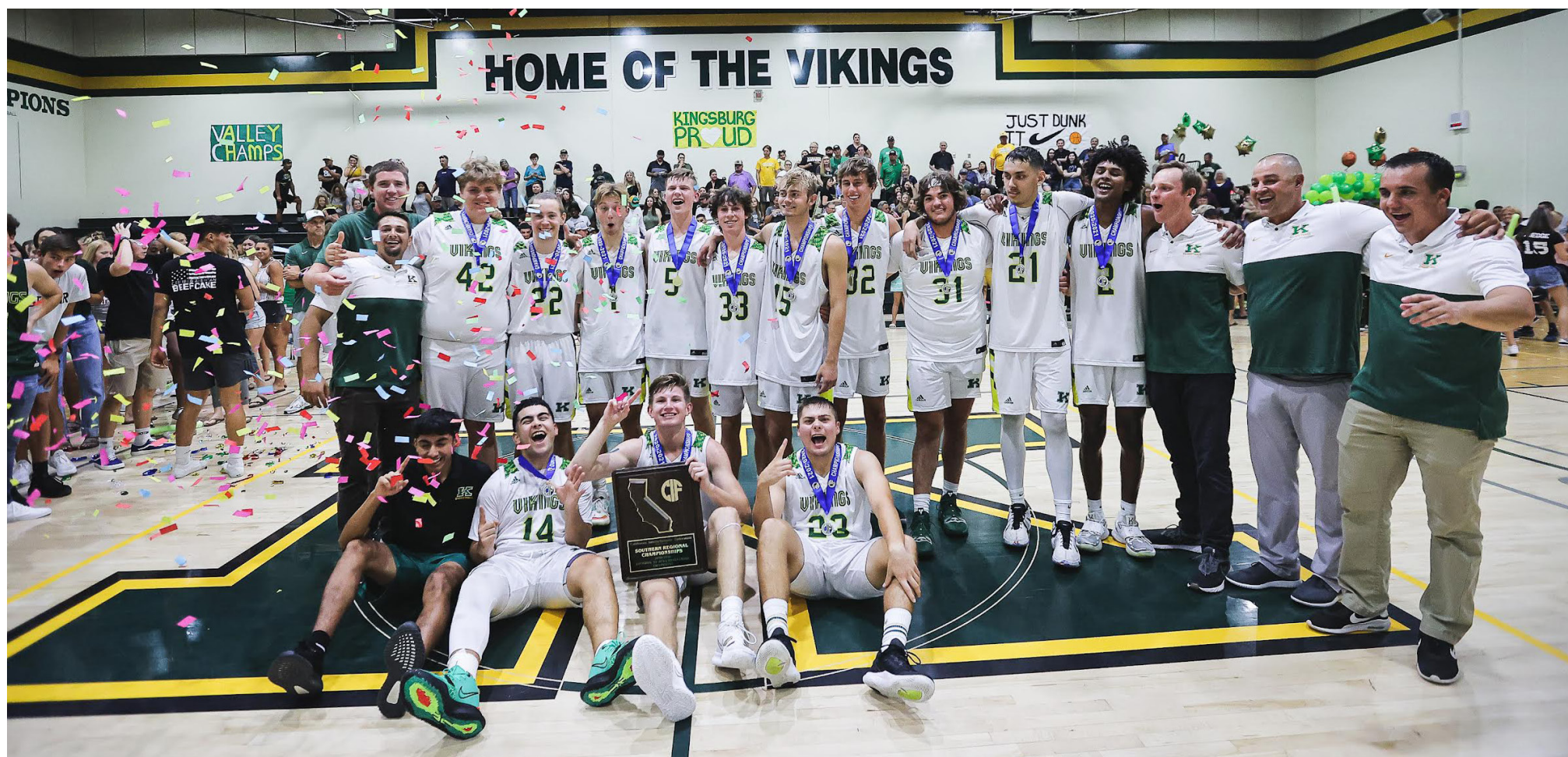
Samual Marshall Photographer